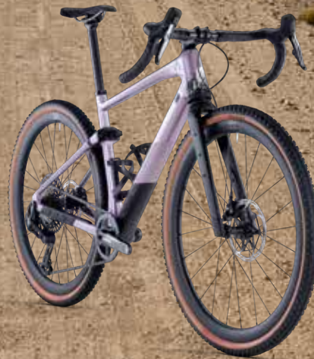
URS 01 LT